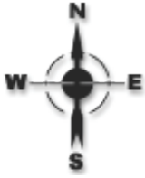
Sketch Floor Plan

Land Size _____ No. of Rooms _____ Construction - Roof _____ Walls _____ Water Pressure _____ No. of Bathrooms _____